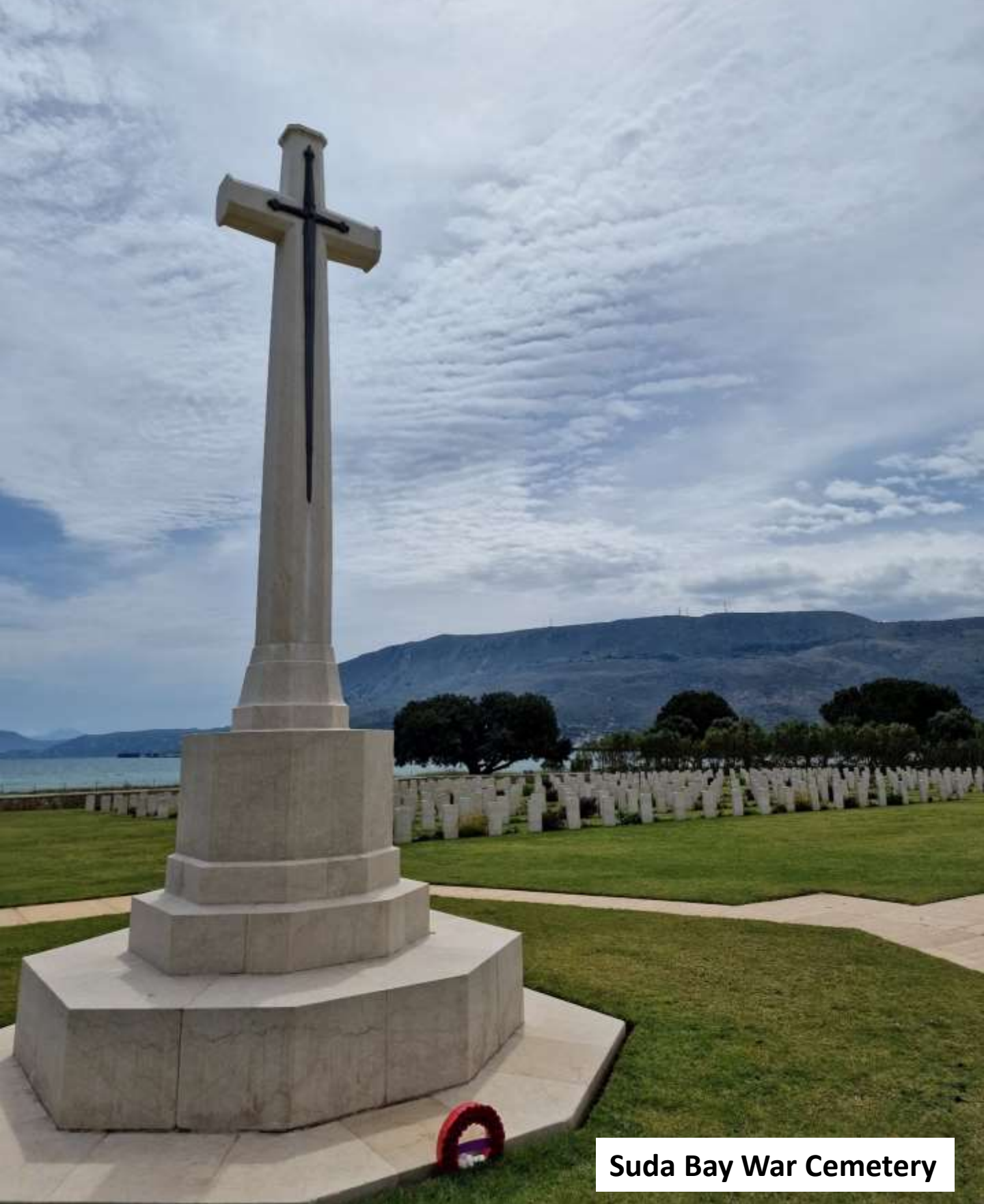
Suda Bay War Cemetery