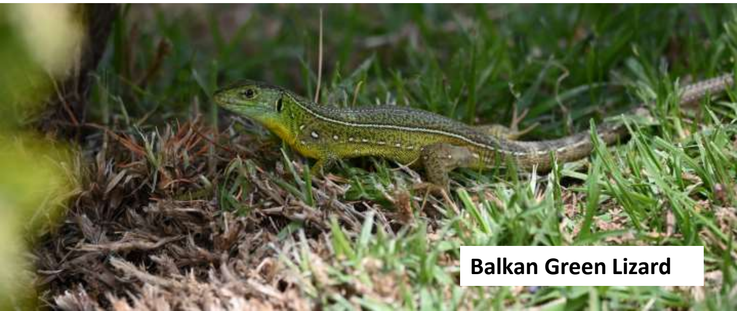
Balkan Green Lizard