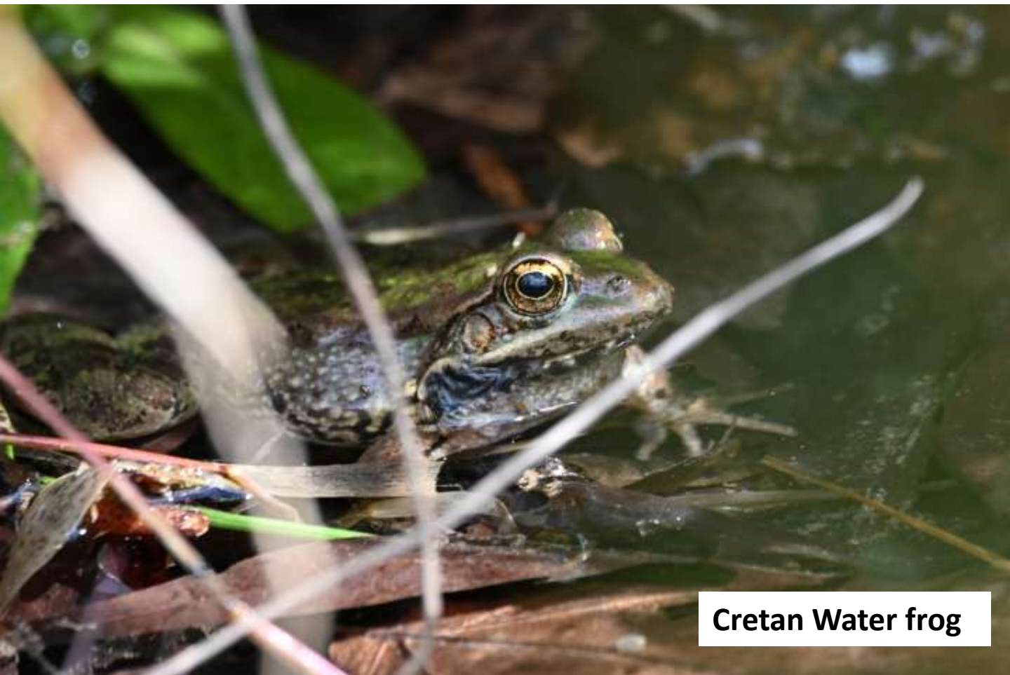
Cretan Water frog

Only a handful of moths pale shoulder the pick, 3 house mice and a black rat the only mammals trapped. I had a quick look at Lake Agia again but not much different to the previous day so I headed off. My first stop was Kourtaliotiko Gorge where near the chapel there was a good stand of Cretan Arum, along with a nice selection of other plants. My next stop was the Spili wildflower meadows, there are many but I concentrated on Orchid Hill, funnily enough for orchids, and there were thousands of several different species and it was a really impressive sight. I did not have enough time to explore all the meadows but did take a look at nice wet meadow with plenty of Cretan red tulips. I made a quick stop at Phaistos ruins which were closed but could be seen from the viewpoint. I headed off stopping for some amazing Dragon Arums by the side of the road.