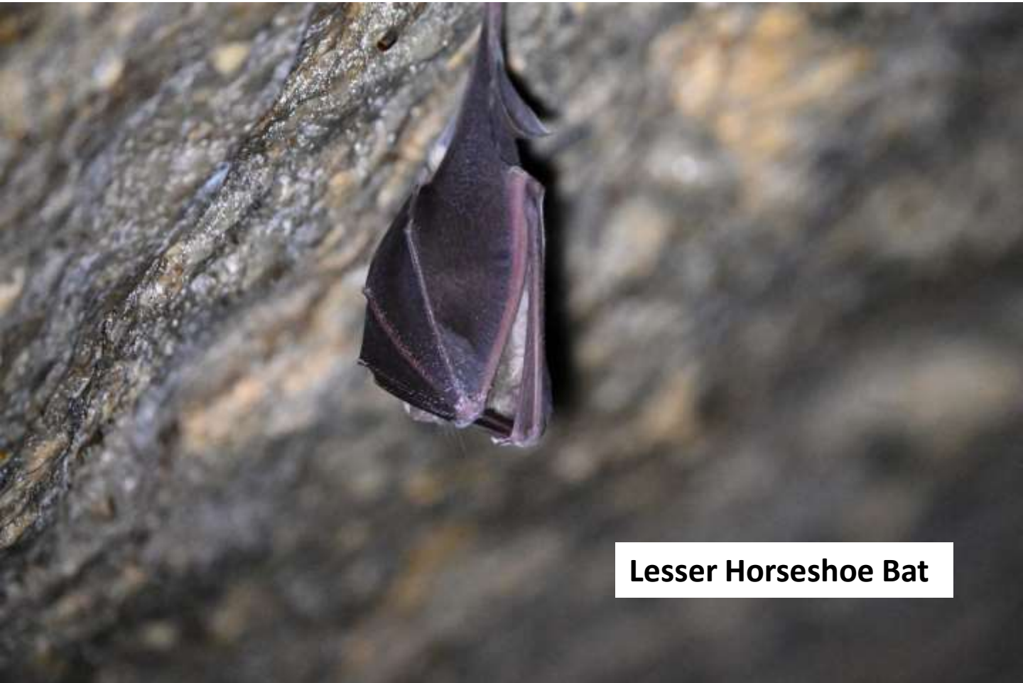
Lesser Horseshoe Bat