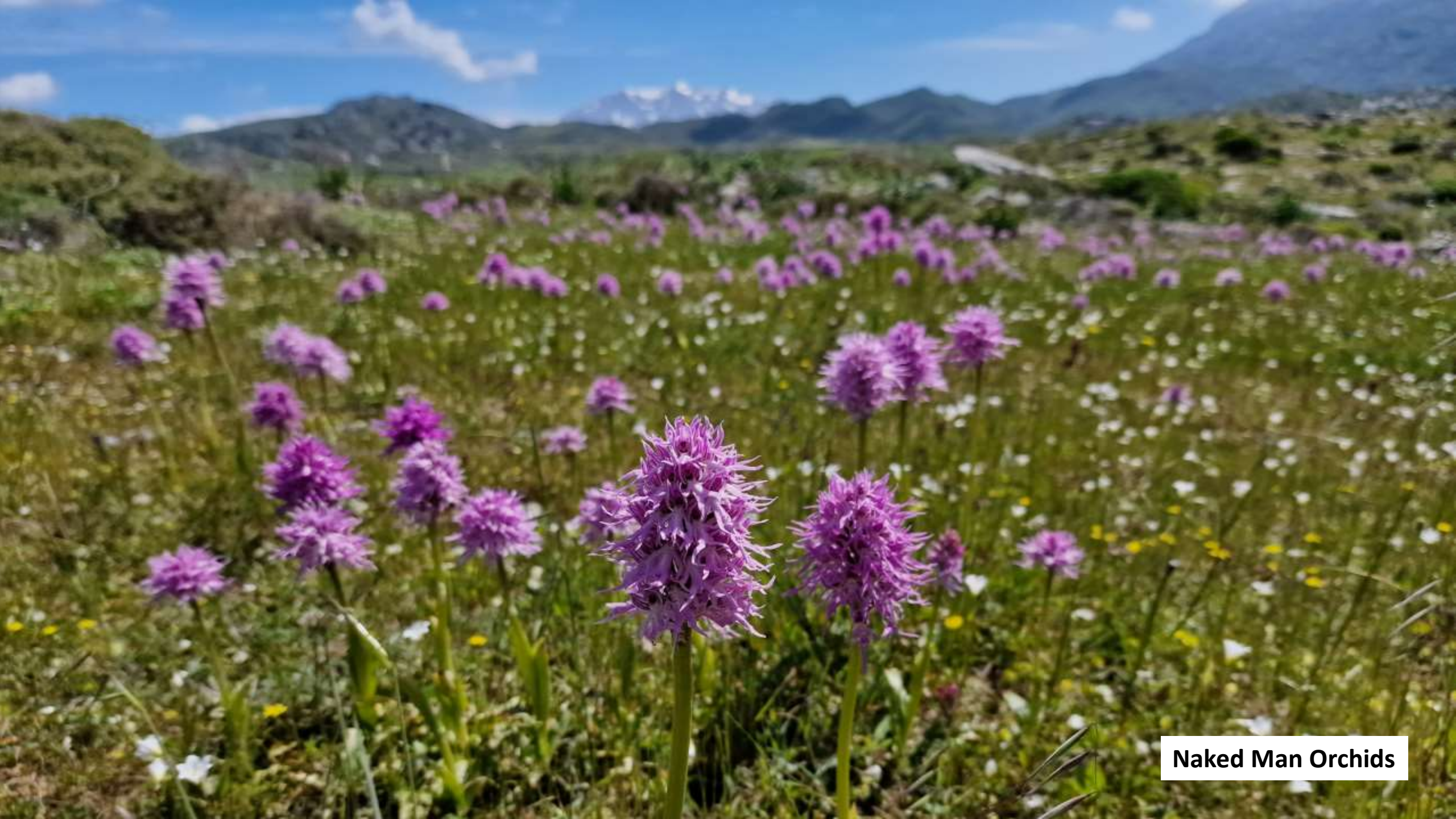
Naked Man Orchids