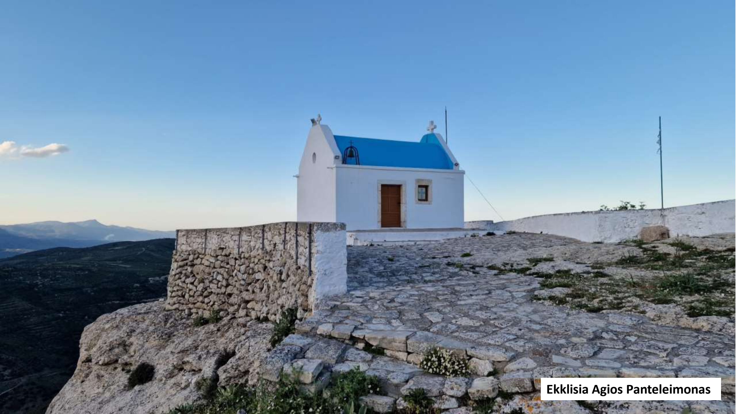
ΕκκλῖςΙΑ Αγίος Παντελεῖμονας