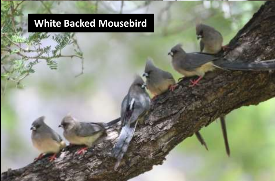
White Backed Mousebird