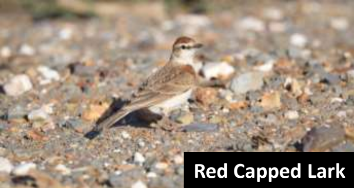
Red Capped Lark