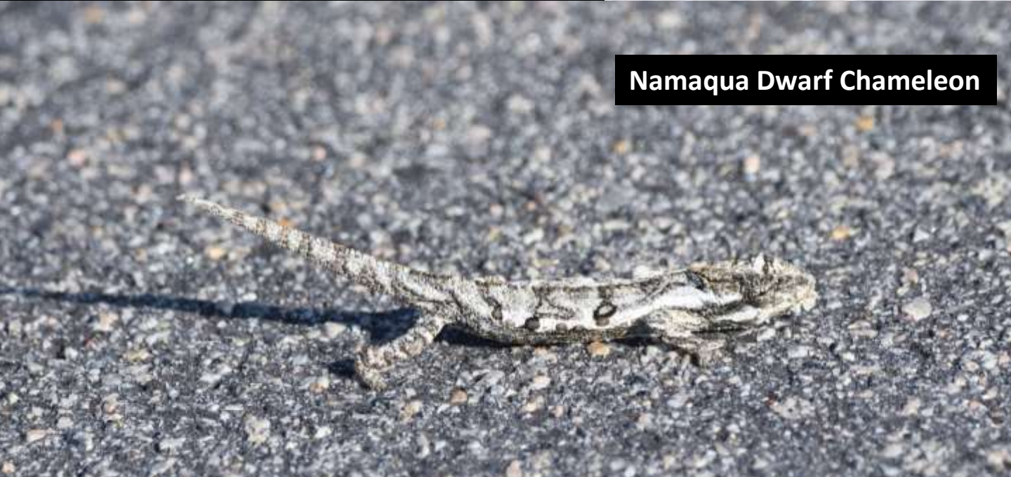
Namaqua Dwarf Chameleon