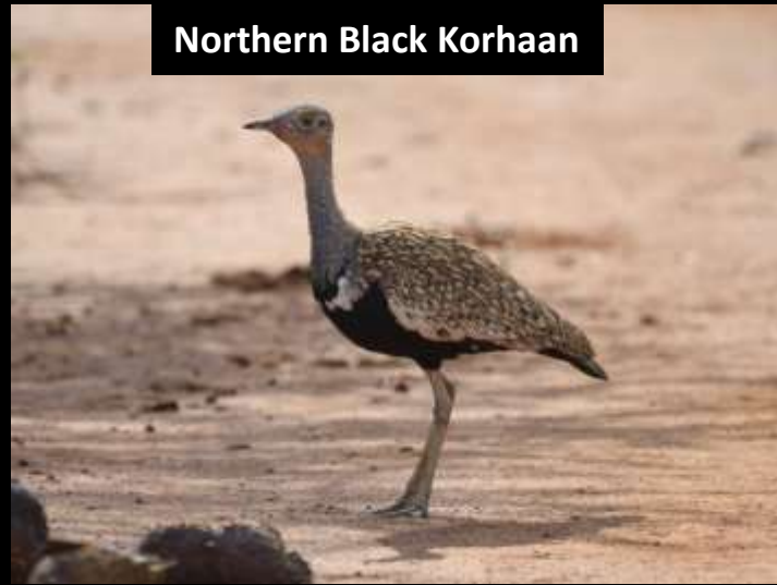
Northern Black Korhaan

We arrived mid afternoon and explored our accommodation which was just outside Bloemfontein in the countryside. The grounds had plenty of South African ground squirrels and a couple of yellow mongooses , a nice African hoopoe and a Bibron's Blind Snake along with plenty of common birds. We headed into Bloemfontein for dinner.