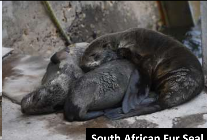
South African Fur Seal