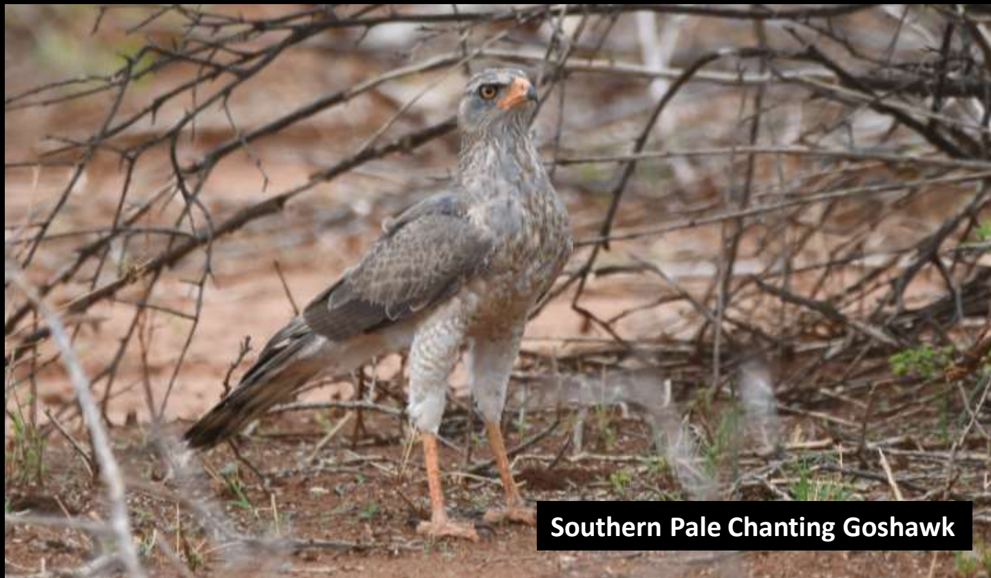
Southern Pale Chanting Goshawk