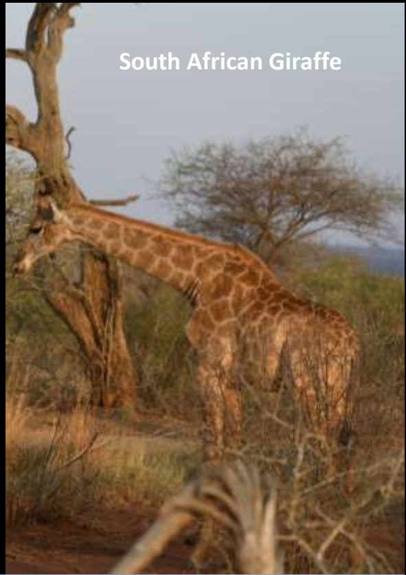
South African Giraffe

We were up early, two bushbucks outside the chalet as we left for an early morning game drive with black backed jackal , waterbuck , spotted hyenas and three white rhinos early on. We located the translocated wild dog pack briefly during the drive along with a Kalahari springbok . We stopped for a bird I can't remember what because two young male lions walked across the road right in front of us, we followed them for a bit until they sat under a tree for a rest. We left them and as we did a we spotted a large male lion following the same line as them maybe chasing them off but very nice to see him so close. The bird of the morning was a cracking kori bustard close to the car and we had a brief view of a tree squirrel as we drove back to camp.