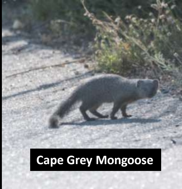
Cape Grey Mongoose