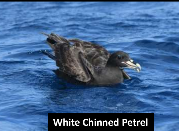
White Chinned Petrel

We headed to the airport making a few stops for birds along the way and we got the flight home without any issues.