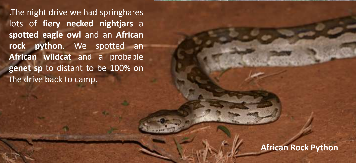
African Rock Python

.The night drive we had springhares lots of fiery necked nightjars a spotted eagle owl and an African rock python . We spotted an African wildcat and a probable genet sp to distant to be 100% on the drive back to camp.