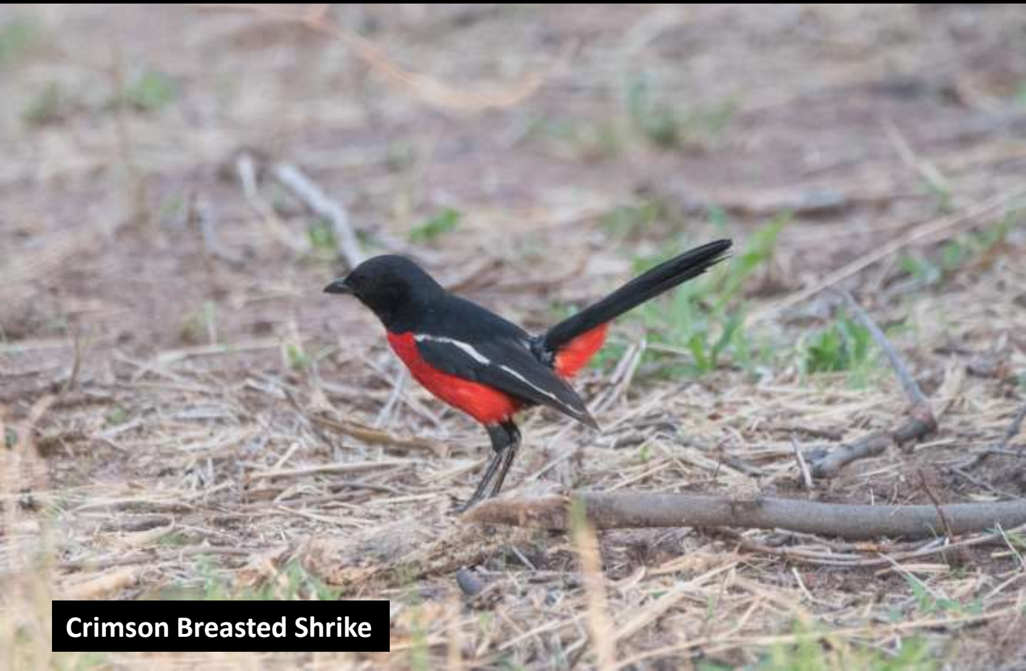
Crimson Breasted Shrike

Ringed Plover Bar Tailed Godwit Wood Sandpiper Sanderling Subantarctic Skua Sabine's Gull Caspian Tern Common Tern Speckled Pigeon Cape Turtle Dove Grey Go Away Bird Marsh Owl Spotted Eagle Owl Fiery Necked Nightjar Little Swift Speckled Mousebird Giant Kingfisher European Bee eater Little Bee-eater