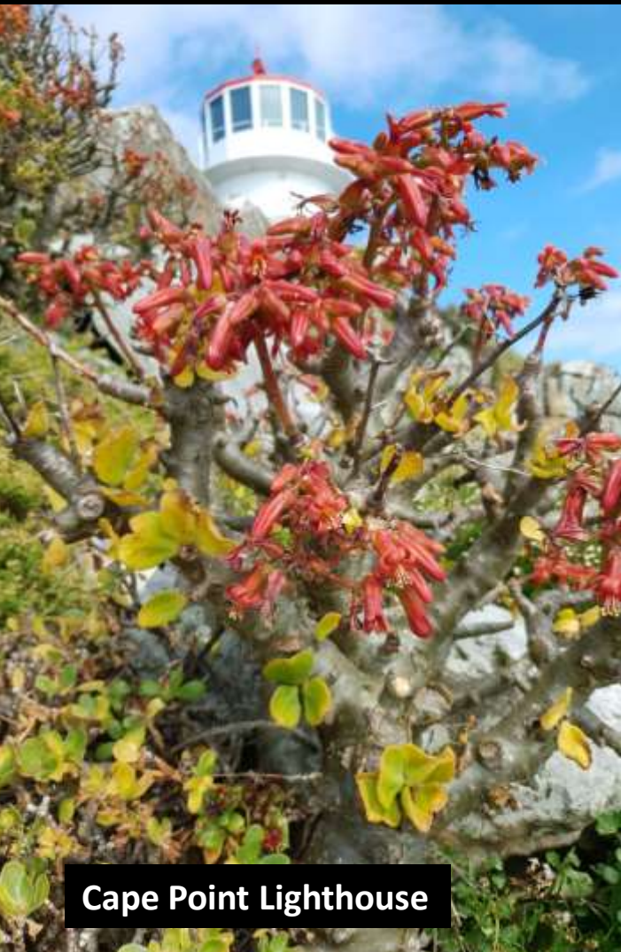
Cape Point Lighthouse

We are at the Table mountain cable car early and got one of the first cars up, the views were spectacular with amazing visibility we could see a very long way. We took a wander, a few agamas and girdled lizards and plenty of plants of note but not much else apart from some confiding orange breasted sunbirds , but we enjoyed the walk and the views. It started to get busy so headed down for lunch then headed to Cape point via the scenic Chapmans peak drive. There were quite a few baboons and we saw one of the baboon patrols ushering them away from buildings. We explored Cape point via the funicular, the cormorant colony could be smelt from quite a way off but apart from a few girdled lizards not much else to be seen. We popped to the Cape of Good Hope for a quick look before exploring the routes through the park where we found some Bontebok , Eland , mountain zebra and plenty of ostrich . The fynbos was blooming with Cape everlasting the dominant flower looking spectacular. We left the park just before it closed and headed to Simon's Town for some food. The Genet made another visit during the evening.