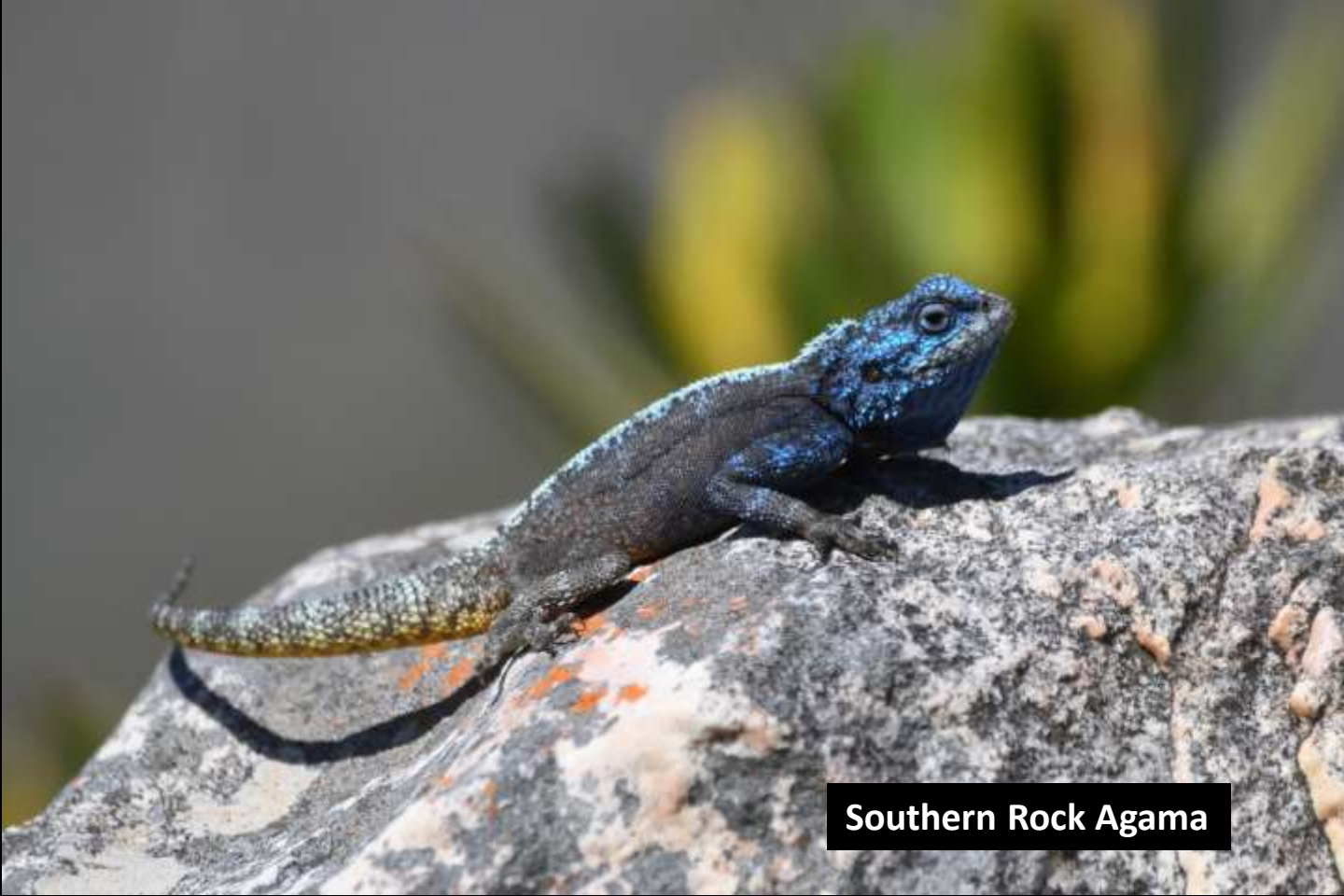
Southern Rock Agama