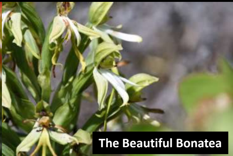
The Beautiful Bonatea