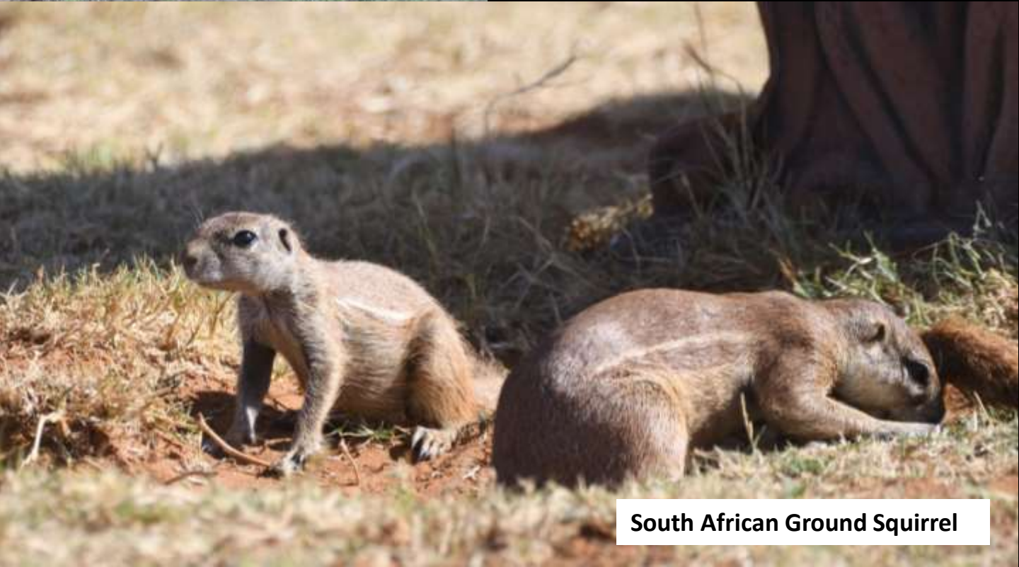
South African Ground Squirrel

We arrived mid afternoon and explored our accommodation which was just outside Bloemfontein in the countryside. The grounds had plenty of South African ground squirrels and a couple of yellow mongooses , a nice African hoopoe and a Bibron's Blind Snake along with plenty of common birds. We headed into Bloemfontein for dinner.