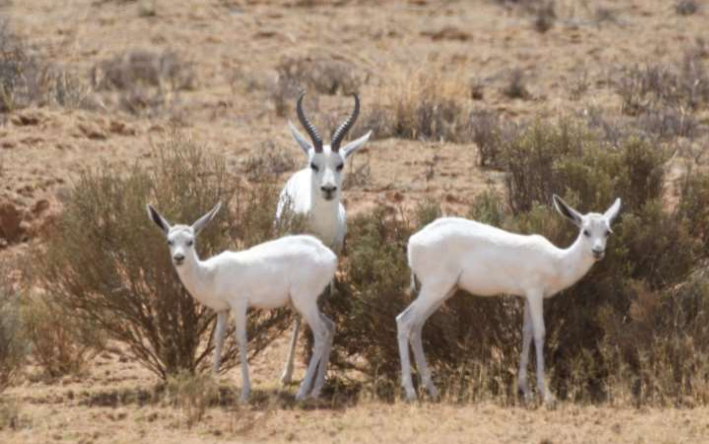
South African Springbok (White Form)