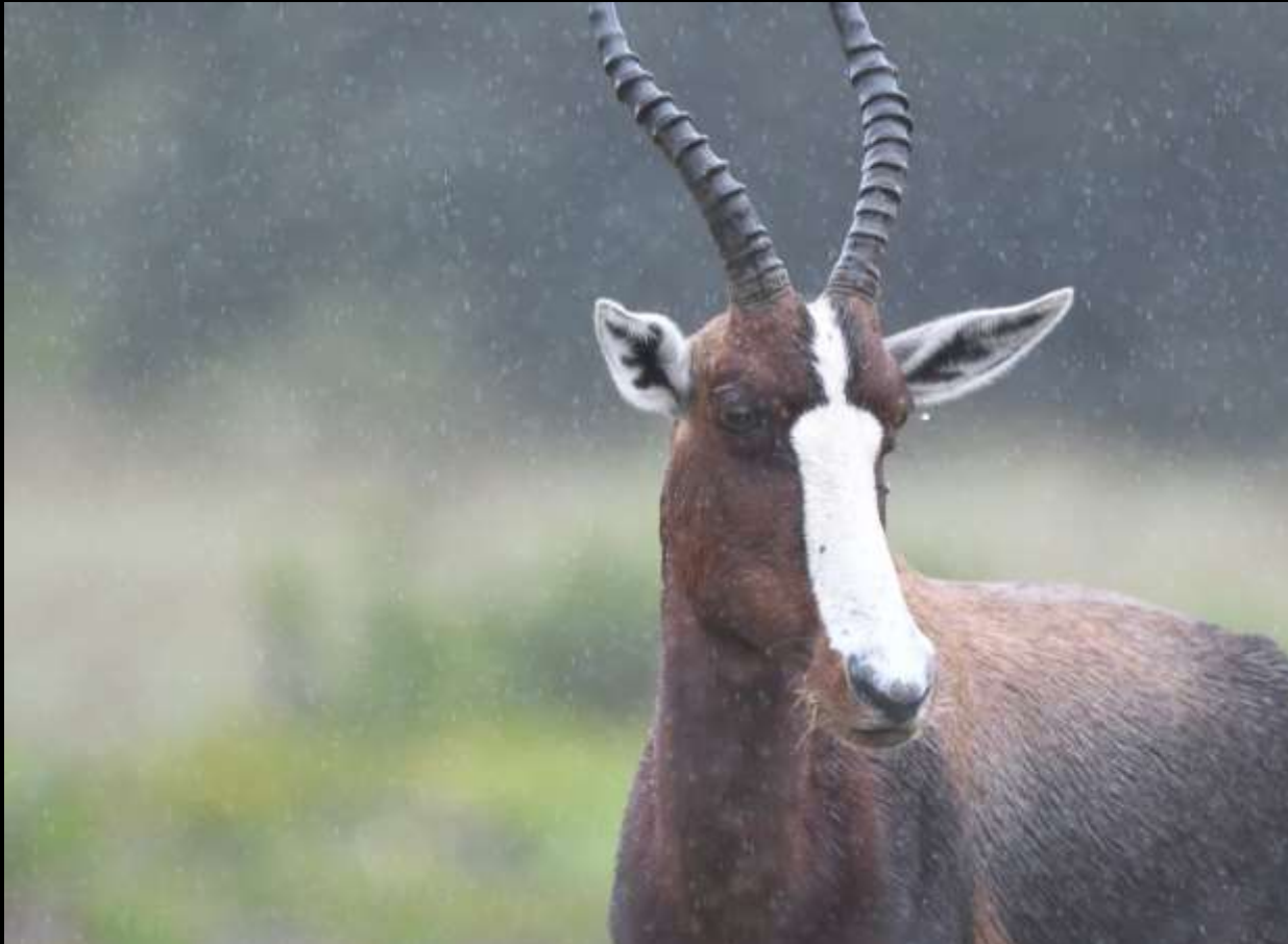
Seen in good numbers at SASOL, De Hoop, Cape Point, West Coast National Park and several road side sightings