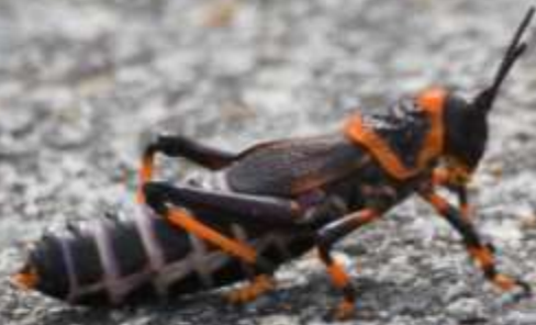
Koppie Foam Grasshopper