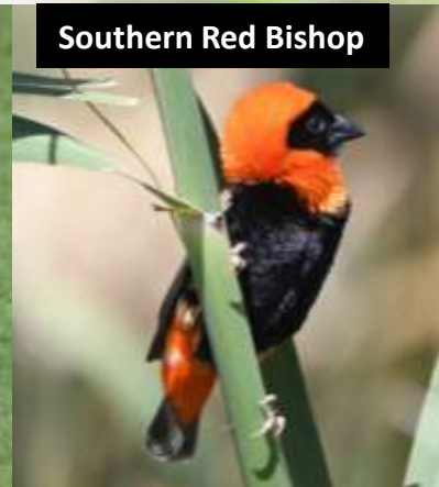
Southern Red Bishop

After dinner we went on the night drive which was full we spotted lots of bats over the water hole, we were stopped by a ranger who had just seen lions and we quickly caught up with a lioness and two cubs just down the road. We watched them for a while before continuing. We flushed a Ludwig's bustard as we headed off. The highlight of the drive was a black rhino and we had a few grey rhebok before we headed back to camp stopping again for the lions that were now much closer to the road.