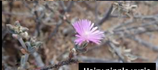
Hairy nipple vygie