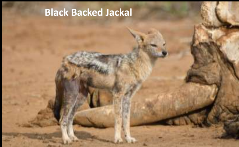
Black Backed Jackal

We headed to a new area on the afternoon game drive, the habitat was different and in the rocks we saw some rock hyrax and Eland . There were some white rhino and a couple of buffalo and we watched the sunset with a herd of elephants