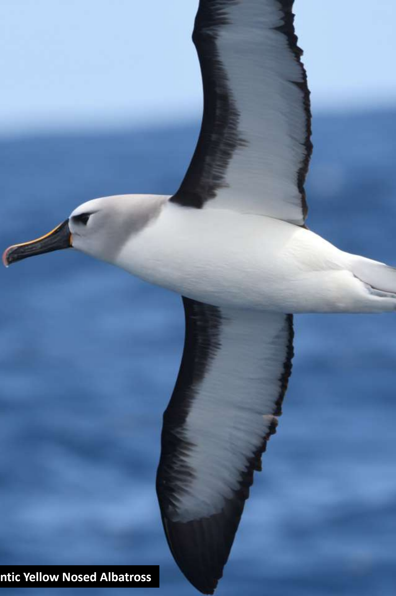
Atlantic Yellow Nosed Albatross