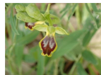
Yellow Bee Orchid