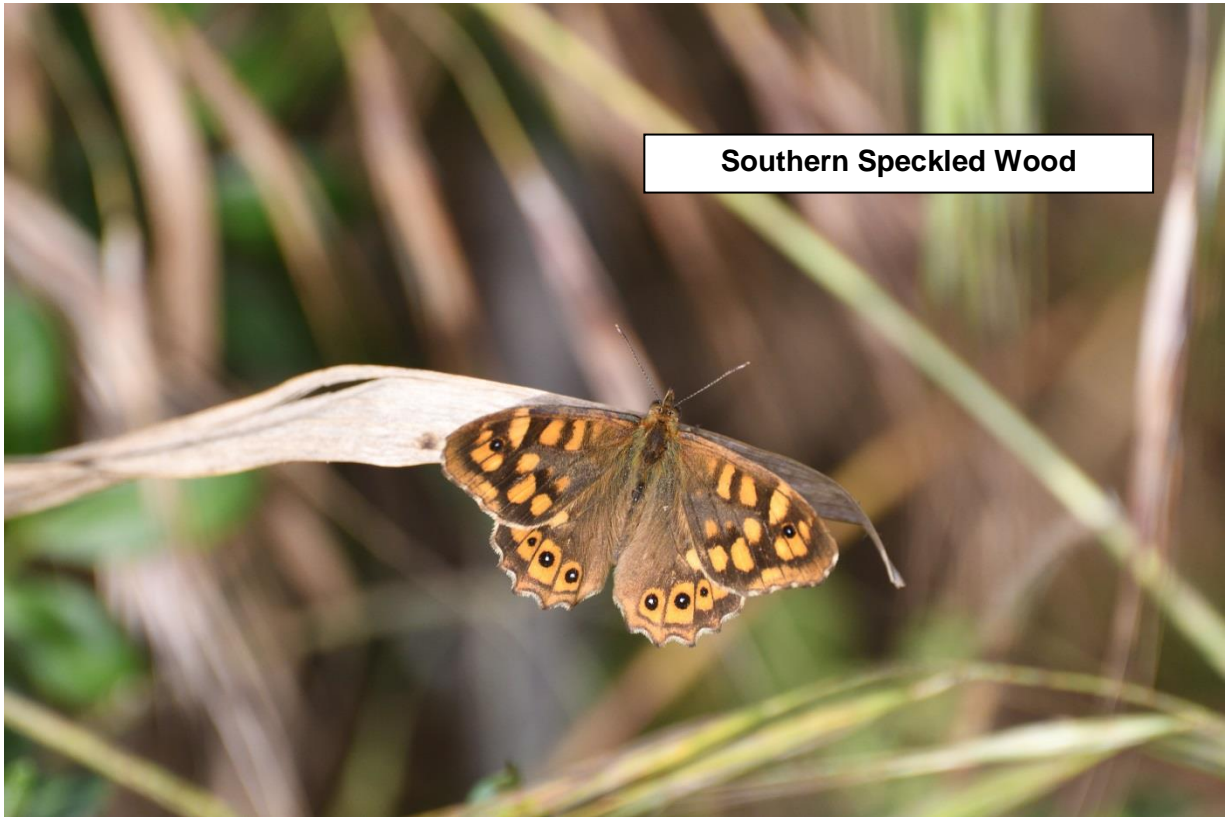
Southern Speckled Wood