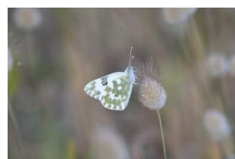
Eastern Bath White