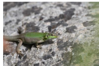
Italian Wall Lizard