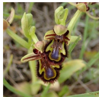
Mirror of Venus Orchid