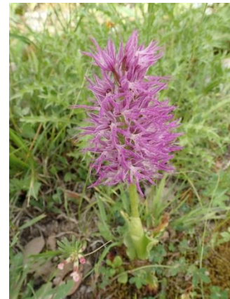
Naked Man Orchid