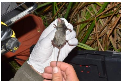
Miller's Water Shrew