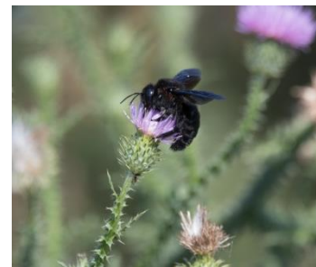
Violet Carpenter Bee