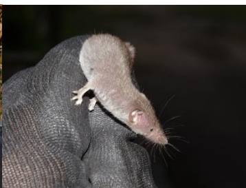
Lesser White-toothed Shrew