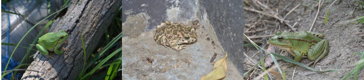
Eastern Tree Frog