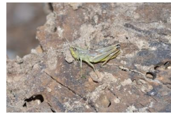
Carpathian Dancing Grasshopper