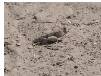
Blue Winged grasshopper

Quail were still calling as we got up and the heat made it easy to dry the tent and kit out. We checked the traps, nothing at all apart from a flock of 8 hoopoe passing by, so we packed up and collected the traps. We headed to the village of Bestepe for supplies. Our car was not able to get to the next site due to the poor road so our kit was taken in the van and we walked the hour to the site. I was not feeling at all well by this time, I had a bad headache and spent most of the afternoon doing little sitting in the shade, travelling light I had no pain killers but fortunately others did and by early evening I was almost human again. The view over the delta was nice and a few hours here watching the world go by was very pleasant. There were plenty of tawny pipits, rollers around. The others had been working hard digging out Lesser mole rat burrows to try to trap one, but had no luck. We checked the traps which were already in place but no captures so we photographed Eastern and common spadefoot toads the others had caught in the rain the previous evening and as the mosquitoes arrived in force we retreated to the tents.