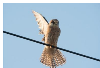
Red Footed Falcon