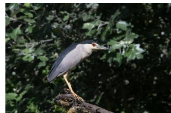
Black Crowned Night Heron