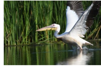
Great White Pelican

We stopped for supplies and headed upto some farmland to set more traps both Pitfalls and Sherman's. We had some photos with the hamster before its release then set about setting up our camp. A nice mantis and a Cone-headed Grasshopper were spotted as quail called all around. I settled into my borrowed tent for the night as the rain started to fall. The rain became torrential and the strong wind blew it in through the vent which would not hold closed and my tent started to fill up with water. I turned it 90 degrees and this at least stopped it coming in the vent but the zips were now exposed and the rain came in there instead and I was forced to retreat to the car for the night.