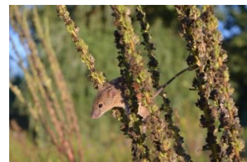
Striped Field Mouse