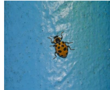
13 Spot Ladybird