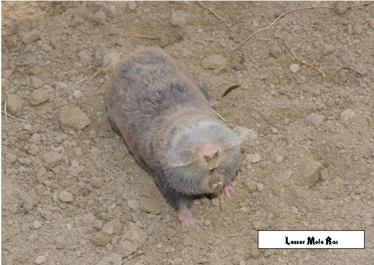
Lesser Mole Rat