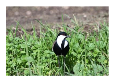
Spur winged plover