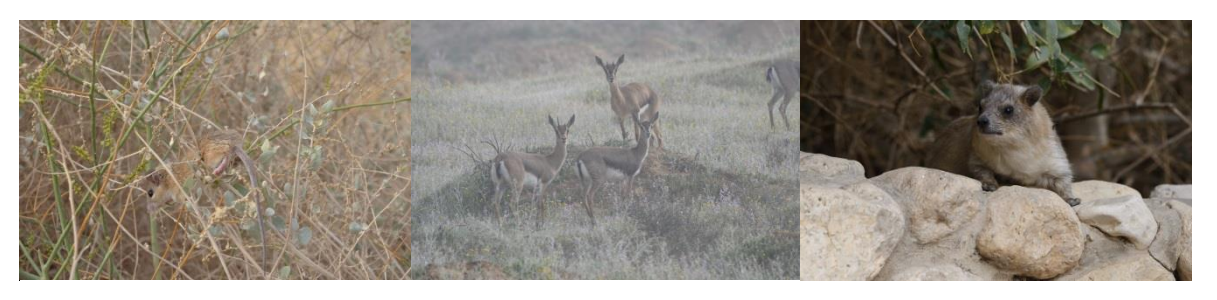
באבדבאח בפוחע מסטבב