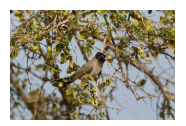
YELLOW VENTED BULBUL