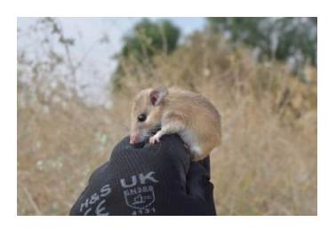
EASTERN SPINY MOUSE

We headed off north encountering a couple of groups of Nubian ibex along the way but the highlight was a massive roost of egrets and black kites. We worked our way up to Tirat Zvi fish ponds, it was a little tricky to find the entrance but well worth the effort as we quickly caught up with a nice Egyptian mongoose and several Pallas Gulls. The place was fully of herons and egrets several black storks and an osprey but it was the large numbers of Egyptian mongoose present that was the real highlight eight in total all showing very well. We headed to Neve Eitan fish ponds far less birdy but we did pick up a pygmy cormorant and a citrine wagtail. We carried on to Manot on the edge of Nahal Kziv reserve encountering several massive black kite kettles on the way. We checked into our nice accommodation with a great host had a cup of tea and just before dusk headed out for a night drive before tea. Not long into the night drive we came across our target a doe Persian fallow deer stood in a small road it was off quickly and we did not see it again. Our drive produced some green toads and we had some food before continuing our drive. Large numbers of military personnel were around the small roads we wanted to drive so we headed back to the sound of shelling. Our host popped by to let us know it was an exercise and nothing else.