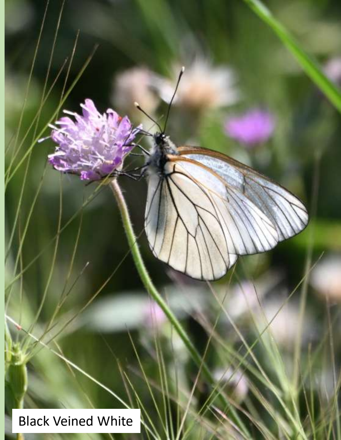
Black Veined White

The moth traps produced little as it was quite chilly overnight , yellow belle and cotton bollworm the best.