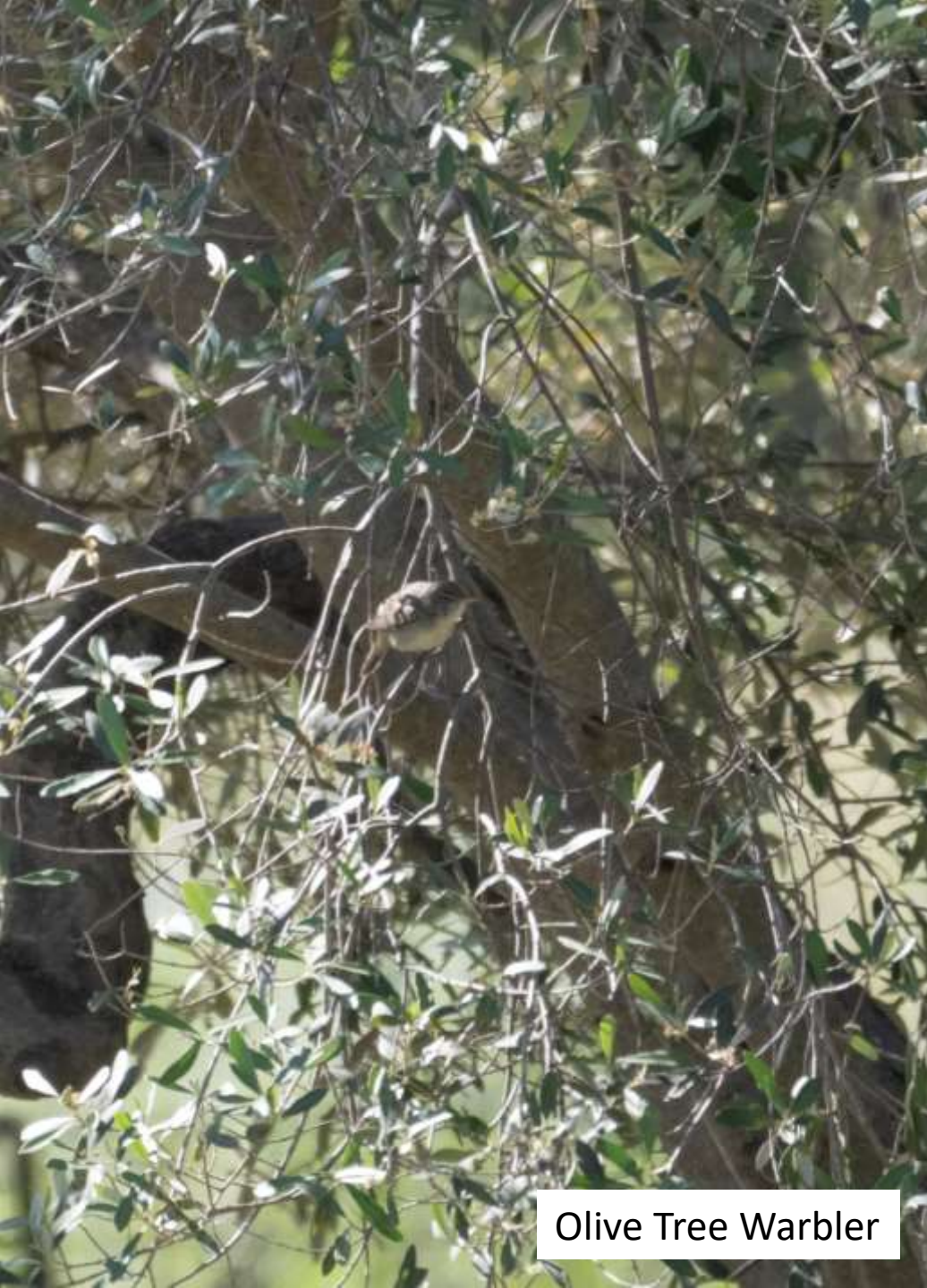
Olive Tree Warbler