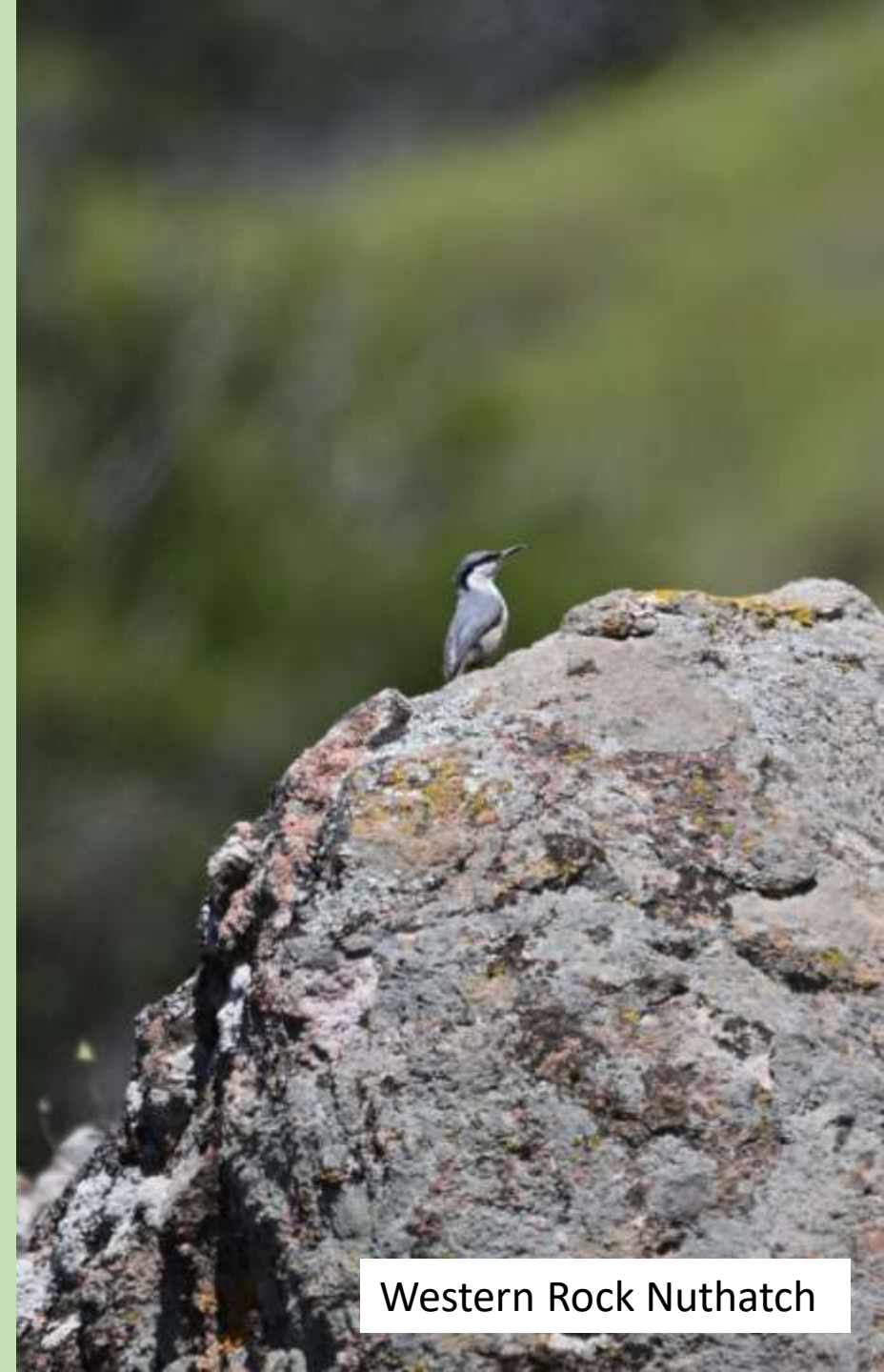
Western Rock Nuthatch