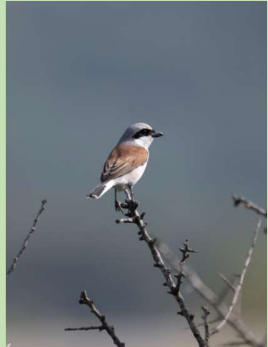
Red Backed Shrike