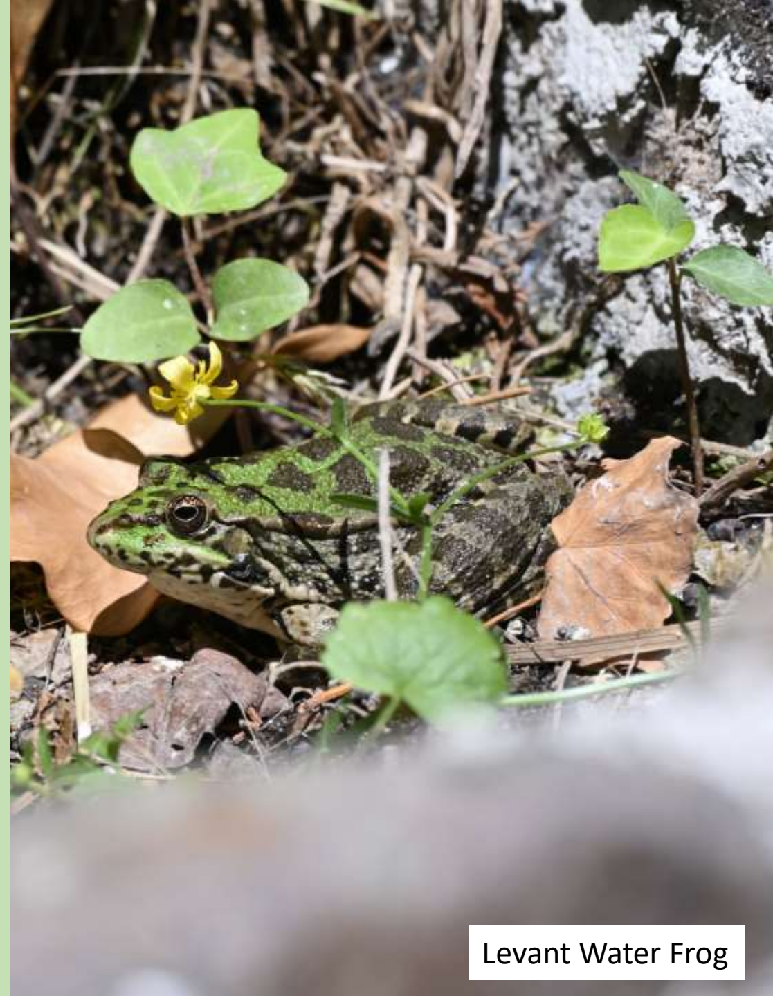
Levant Water Frog

I ran the moth traps just outside the hotel until the batteries ran out and had a Turkish house gecko in my room as I went to bed.