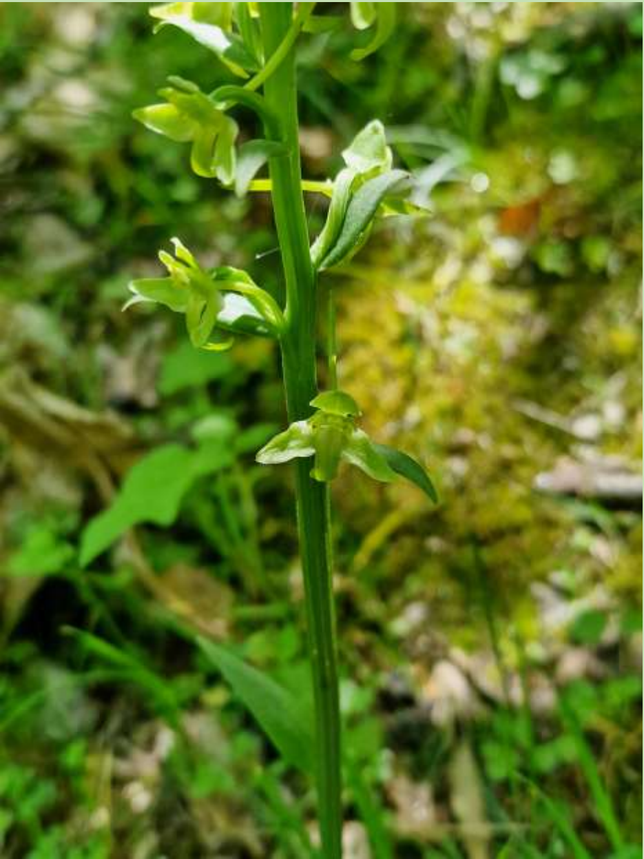
Holmboe’s Butterfly Orchid