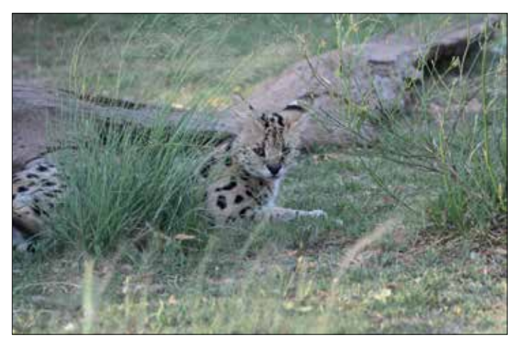
Serval.