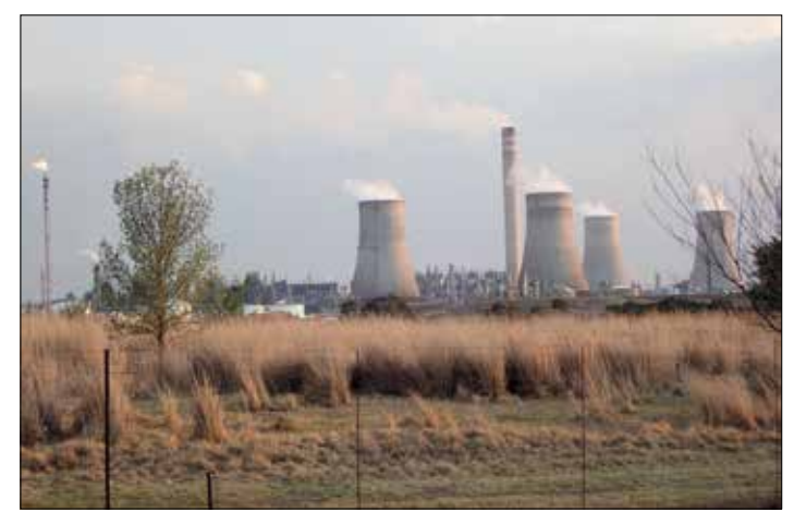
SASOL plant and vlei grassland.