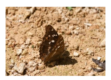
Lesser Purple Emperor