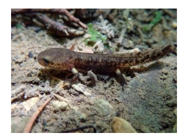
Fire Salamander eft

After dinner we did some bat trapping catching in the area where we met the gun carrying local a few days before, it was uneventful on that count but we did catch a few more bats, 2 leisler's bats, and singles of Alcathoe's, Parti coloured and Geoffroy's bats.