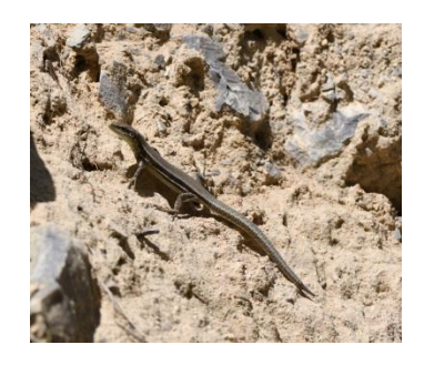
Common Wall Lizard

We checked the traps at Trojan again, this time at night, we were stopped at a police checkpoint but they quickly recognised us and we were sent on our way. A wildcat crossed the road on the way giving us all a good look and this was the highlight of the day. The traps were empty and we saw nothing else of note.