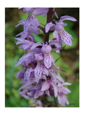
Sack-carrying Marsh orchids