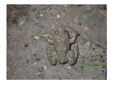
Yellow Bellied Toad