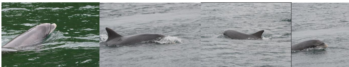
Fungie the Bottlenosed Dolphin