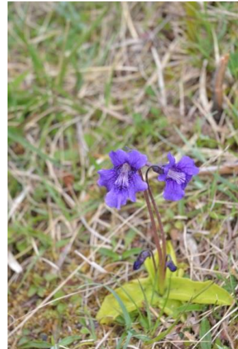
Large Flowered Butterwort

I had a leisurely morning photographing gulls and wandering round Dingle until the boat trip at 11am. We headed out into the harbour which was very calm – thankfully. We passed plunge diving gannets and feeding black guillemots to where 'fungie' the famous bottle nosed dolphin was. He showed quite well a few times allowing for photographs and was too close for my camera for quite a bit of the trip. He has been in the harbour for over 30 years and tours run daily. Safely back on dry land it was time for lunch and I had some chips before heading north making a few tourist stops on the way. Late afternoon I headed to Loop head and the Bridges of Ross both for the spectacular scenery but also for the nesting guillemots , razorbills and kittiwakes . A nice family of stonechats and a few meadow pipits were battling with the strong wind. There were carpets of wildflowers on the headland including super displays of both early and western marsh orchids . I headed for the Burren where I was staying for the next few days.