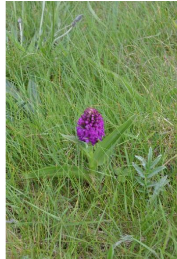
Western Marsh Orchid

I spent the first part of the day looking for orchids in the Gortlecka area of the Burren a dense flowered orchid was located but had gone over and indeed it looked that the season was further advanced than usual, flecked marsh orchids were nearer the shore of Loch Gealain. Here I met Gary from Somerset and we had a nice chat about the Burren's plants, he had visited before. The sun disappeared and rain arrived so I headed off to the Cliffs of Moher along with thousands of other tourists. The rain moved off and I took a look at the seabird colony, the tourist only interested in the puffins , but I was really after choughs but only got a couple of flybys, they were a little elusive. I had enough of the crowds so I headed off up the coast and explored Poll Salach, a large area of limestone pavement which had a few Irish hares and a nice selection of plants including thousands of heath spotted orchids and in a few spots early and western marsh orchids . Last stop was Fanore where I searched the dunes for dense flowered orchids without luck, but plenty of rabbits were digging the place up. I tried a nearby limestone pavement where a local botany group were searching, but they had not seen dense flowered orchid either but recommended Blackhead as a reliable area, I would try in the morning. I headed for some food and called it a day.