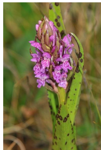
Flecked Marsh Orchid

The weather was very poor with drizzle and thick mist so I did a few touristy things until late morning. The weather did improve so I visited a few spots on the coast ending up at Blackhead, I spent a few hours searching for orchids but could only find a few dense flowered that had gone over apart from a couple not yet out right near the top, but I never got round to revisiting to see if they were out later in the week. I explored a couple of other sites but did not really see much else apart from Moorhen and a Holly blue . I ended up at Gortlecka for a wander round where I bumped into a local knowledgeable couple and we chatted for a while about local wildlife, before I headed into Gort for some food.