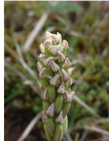
Dense Flowered Orchid

After breakfast I headed to woods for a wander for butterflies, there was a nice selection some fresh brimstones , a tatty peacock and wood and green veined whites. Next I headed to Gortlecka, for a walk down the green road for butterflies, the conditions were very good and I parked behind another car, three people from Wexford were on a similar mission to me and we wandered the Green road together looking for butterflies, wall browns were very common but got the first small heaths of the trip and several pearl bordered fritillaries , but they were very active and I could not get a photo. It was a pleasant walk ending back at the car for lunch and then we took another wander round the nature trails where we saw peregrine and buzzard and a selection of butterflies. My fellow butterfly enthusiasts recommended a place for Marsh Fritillaries, I found it despite the rather scant directions but the site had been dug for peat and the only butterflies I saw were orange tips , so I had some food and called it a day.