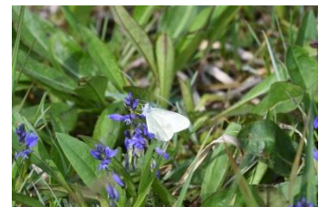
Cryptic Wood White

I was at the rather small Lullybeg nature reserve near Allenwood just after 9am, the sun was up and it was warm. Cryptic wood whites were everywhere, and a red admiral flitted back and forth along the track. The target was Marsh Fritillary , and they were already flying and several showed well. I spent some time photographing them and took a wander round the environs of the reserve where I encountered several azure damselflies , but not much else. I headed off for an early lunch and a bit of shopping. Next stop was at Dublin airport to look for Irish hares . They were a bit elusive but I eventually found a large group although a distance away. There was the odd individual closer here and there, and they regularly crossed taxiways between aircraft and vehicles. Eventually one hare was spotted close to the fence and allowed a few reasonable photos, but none at point blank range. After having my fill of hares I headed into the centre of Dublin for walk round. I visited several of the major sights and wandered by the river in the pleasant sunshine before a bag of chips, bird wise there was a few gulls by the harbour but little else and I took the ferry to Holyhead after a good trip.