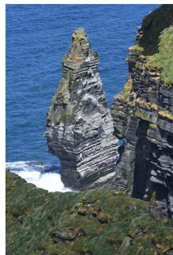
Cliffs of Moher