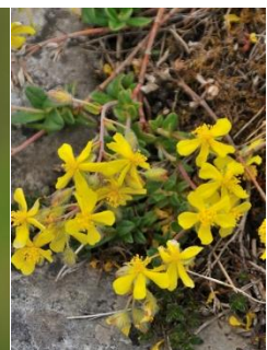
Hoary Rock Rose