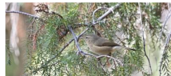
Canary Island Chiffchaff

After an indulgent evening I was not too bad when I awoke, but I had misjudged dawn and it was still dark and the weather was not ideal for wildlife watching it was very wet and windy. After a quick breakfast we headed up to the Las Lajas Picnic site famed for blue chaffinch, but although free of people it was free of birds. The wind and rain made birding very difficult and I only found a rock dove and a Great spotted woodpecker . Next stop was equally as bad so we tried the El Portillo restaurant, at least now the rain had stopped and it was much brighter but incredibly windy. We had some chips and watched the bird feeders but only a blue tit visited and a canary was singing from a nearby bush.