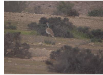
Mac Queen's Bustard

We drove to Yovatta and found a very good service station run by the Kibbutz which had lots of locally made food and we ate our fill, finished off with a rather large ice cream. We drove the Yovatta fields spotlighting but only found a couple of nightjars , a red fox and a golden jackal . We headed back to Eilat taking a detour to Amram's pillars. Our efforts here were quite good we had 5 dorcas gazelle and a cape hare before calling it a night, well as best we could do with all the noise from the floor above (bloody drunken tourists!)