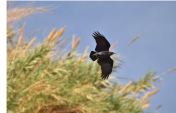
Fan Tailed Raven