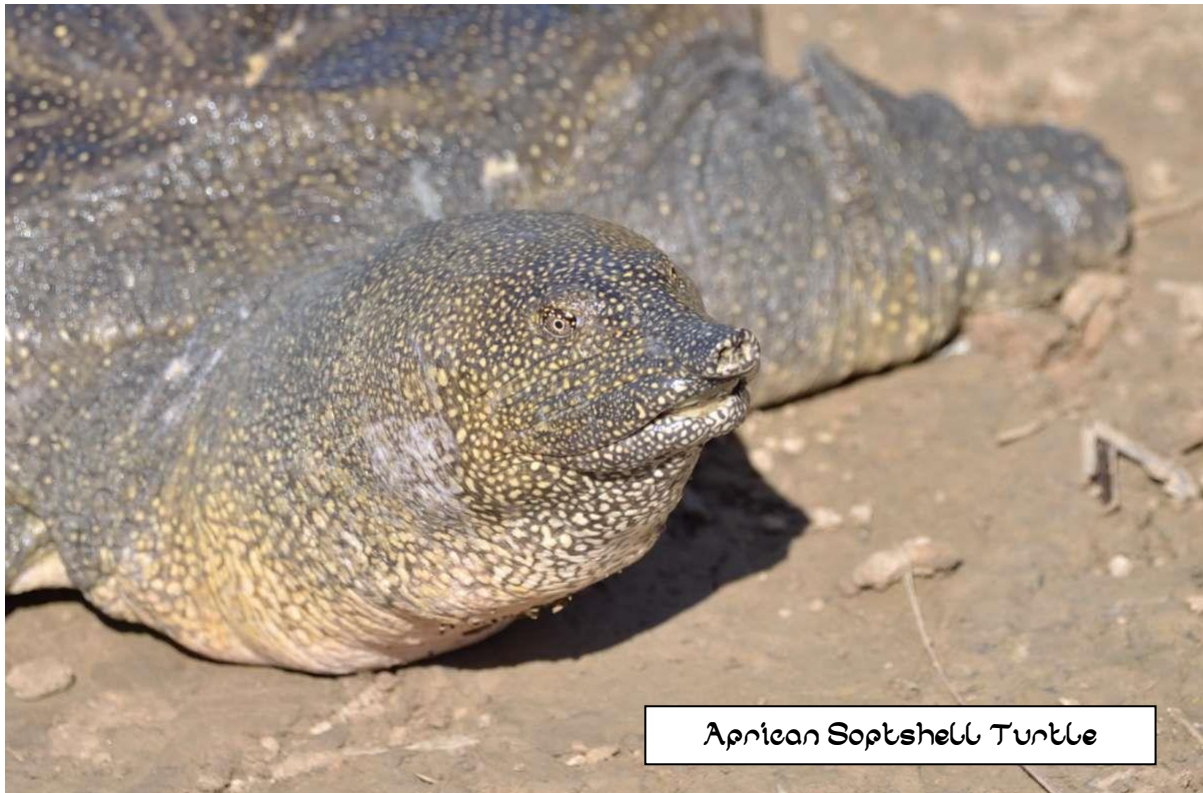
African Softshell Turtle