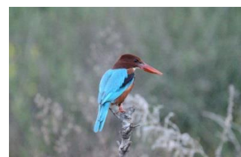
White breasted Kingfisher