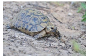
Spur Thighed Tortoise

We checked the traps a couple of house mice were trapped but nothing else, however a couple of traps had been used by rats, one had even escaped by pushing the back of the trap off. We packed up and sorted things out back at the accommodation, a pair of Syrian woodpeckers of note as we packed up. We headed south to Kfar Vitkin, here we were looking for the African softshell turtle viewing area but somewhere we took a wrong turn and ended up at the wrong place. We took a walk down the river anyway, here we saw common kingfisher to complete the kingfisher set for the trip and a nice spur thighed tortoise but not the turtles. We eventually found the correct site and easily found the about a dozen of the rather large African softshell turtles and a red eared slider . We had some lunch nearby and headed to Tel Aviv. We found a large park but could not find any roosting bats anywhere. We did find a few feral geese , Muscovy ducks , Egyptian geese and a hoopoe on our walk but with time getting on we headed to the airport, battled with the car hire company, battled with Israeli security and then battled with the mayhem on the plane, none of the locals were happy with their seats and would not sit down and we took off well over 30 mins late just due to this.