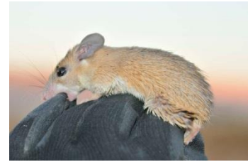
Eastern Spiny Mouse

So no trapping was possible but we took a night drive along the Masada road for some spotlighting however it only produced two red foxes and a cape hare and a calling owl that we could not locate before calling it a night and some well-earned rest.