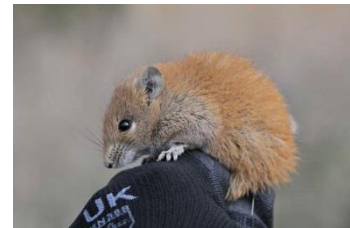
Golden Spiny Mouse