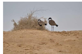
Spur winged Plover