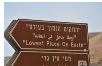
Lowest Place On Earth