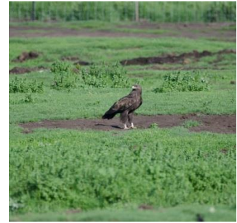
Great Spotted Eagle