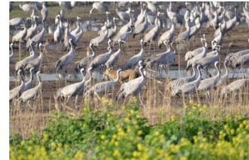
Jackal and Cranes