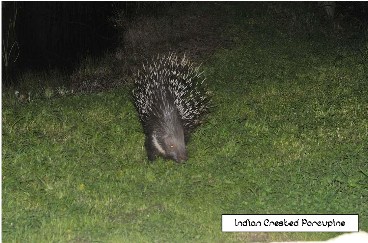
Indian Crested Porcupine