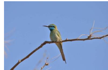
Little Green Bee-eater