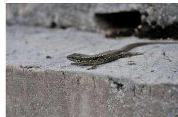
Common Wall Lizard