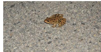
Water Frog sp