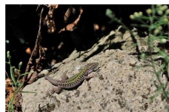
Italian Wall Lizard