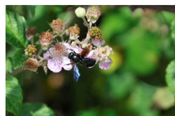
Violet Carpenter Bee