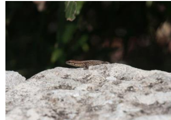
Common Wall Lizard