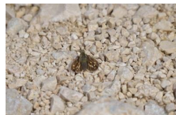
Silver Spotted Skipper