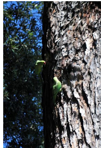
Ring Necked Parakeet