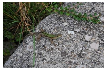
Italian Wall Lizard